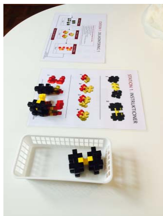
Sub-assembly station 1